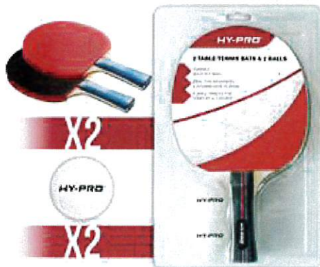
Table Tennis Set