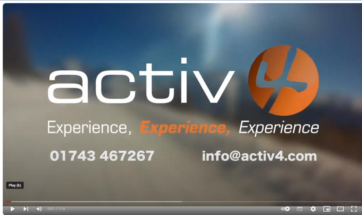
Activ4 Sestriere Ski Trip

Built by the Agnelli Famil (Fiat Car Company) in the early 30's Sestriere is renowned for its excellent snow conditions, it's high (the village itself is at 2000m) it faces north west and also has extensive snow making facilities.